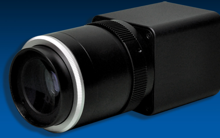
2.00 x 2.00 x 2.43 inches (50.8 x 50.8 x 61.7 mm)